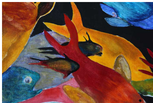
Détails de la peinture "Aquarium 1" (toute de grande toile de 7 mètres x 1 mètre) de Dominique Lestel.