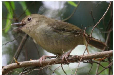
Atherton Scrub Wren

Birds like the Plain Wren, Atherton Scrub Wren, Carolina Wren, and even Common Babblers sing complicated