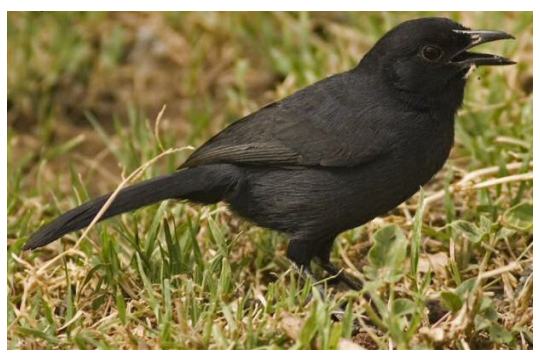
Slate-colored Bou Bou

An African bird called the Slate-colored Bou Bou has a sound that resembles the woodblock, a percussion instrument that originated in Africa. Maybe the Africans were inspired by the bird's call. There are tales after tales that say how man was inspired by the songs of nightingales and sparrows and cuckoos.